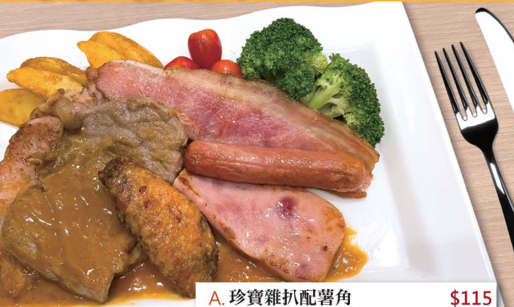
A. 珍寶雞扒配薯角 $115 (豬扒、牛扒、雞中翼、火腿扒、腸仔、煙肉) Jumbo w/ Potato Wedges (Pork Chop, Steak, Chicken Wing, Ham Steak, Sausage, Bacon)