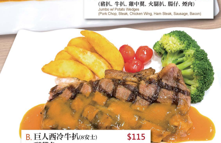
B. 巨人西冷牛扒(8安士)配薯角 $115 Giant's Sirloin Steak (8oz) w/ Potato Wedges