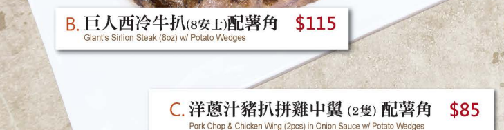
C. 洋蔥汁豬扒拼雞中翼(2隻)配薯角 $85 Pork Chop & Chicken Wing (2pcs) in Onion Sauce w/ Potato Wedges