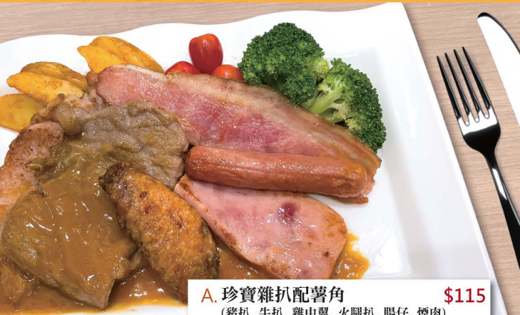
A. 珍寶雞扒配薯角 $115 (豬扒, 牛扒, 雞中翼, 火腿扒, 腸仔, 燒肉) (Pork Chop, Steak, Chicken Wing, Ham Steak, Sausage, Bacon)