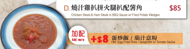
D. 燒汁雞扒拼火腿扒配薯角 $85 Chicken Steak & Ham Steak in BBQ Sauce w/ Fried Potato Wedges

加配 +$8 蛋炒飯 / 茄汁意粉 Add more +$8 Egg Fried Rice / Spaghetti w/ Tomato Sauce