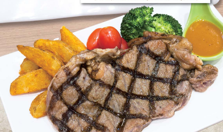
B. 巨人西冷牛扒(8安士)配薯角 $115 Giant's Sirloin Steak (8oz) w/ Potato Wedges